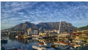
Figure 1 – How to insert a figure

Fill with text. Fill with text. Fill with text. Fill with text. Fill with text. Fill with text. Fill with text. Fill with text. Fill with text. Fill with text. Fill with text. Fill with text. Fill with text.